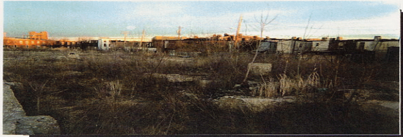
Photo 6: Portion of old building foundations on southern portion of site