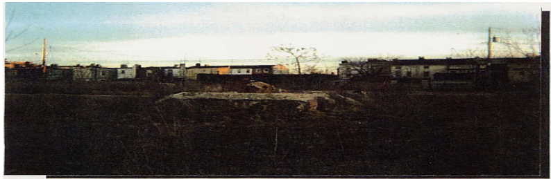
Photo 5: Portion of old building foundations on southern portion of site